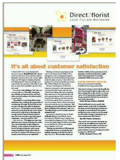
This months FW&B magazine feature direct2florist on the front cover.

Read all about it! Front cover exposure + d2f article on inside pages.